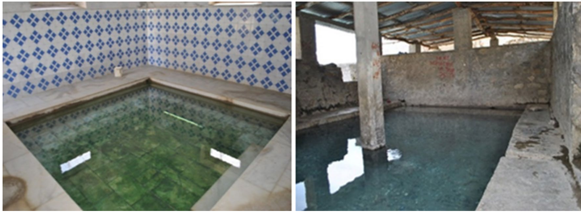
Fig. 2 Bathing area