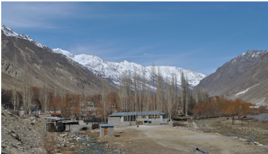
Fig. 1 Chutrun Hot Springs, Shigar Valley, Gilgit-Baltistan

Water samples were collected from four thermal springs of Chutrun in polyethene screw capped bottles in March 2018. The sample bottles were washed with tap water followed by rinsing with distilled water before collecting the samples. All precautions were taken during sampling, transportation and storage.