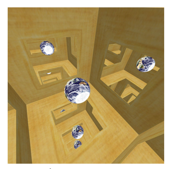
Fig. 2 Universal Covering Space of T^3

to exploit a higher-dimensional version of this representation in some way. Figure 2 represents the case of T^3 viewed from a "corner" of real space with Earth closest to us.<sup>34</sup>