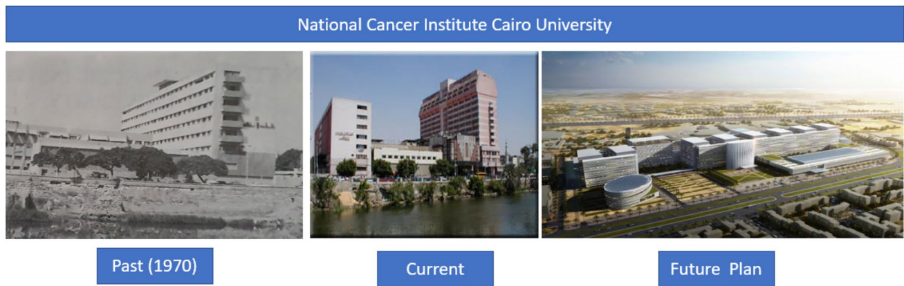
Fig. 4 National Cancer Institute, Cairo University

Multidisciplinary collaboration between the NCI-Cairo departments was emphasized, practiced, and applied to clinical protocols, inpatient and outpatient activities, and follow-up of patients. According to the hospital-based registry of the NCI-Cairo for the period 1970–1984, 30,416 new cancer cases were managed. Thirty percent of those patients had schistosoma-associated bladder cancer [1]. Currently, the hospital receives a little over 10,000 new patients per year, and the most common cancers are breast cancer among females and liver cancer among males.