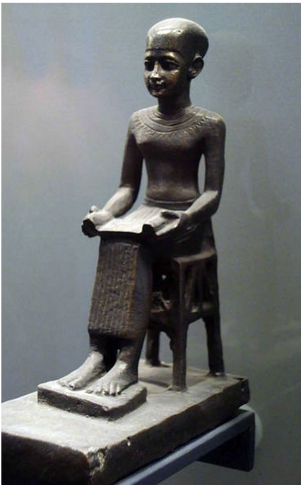
Fig. 2 Imhotep

oncology, clinical pathology, and tumor biology departments were created in early 1970s. Before the introduction of medical oncology, systemic cancer therapy was given to patients by surgical oncologists. At that time, four drugs (vincristine, cyclophosphamide, methotrexate, and melphalan) were the only available medications for treatment and were given mostly as single agents. The inpatient service of the medical oncology department started by 30 beds, five of which were assigned for pediatric patients. Two daily outpatient clinics, one for adults and another for pediatric patients, provided diagnosis, follow-up, and administering chemotherapy. At that time, the medical oncology faculty consisted of a junior assistant lecturer, then late professor Reda Hamza, and two residents, one for adults and another for pediatric patients. Professor Hamza had a 6-month training at the Institute Gustave Roussy in Paris. Then the late professor Nazli Gad El Mawla joined the department after she received a short training in medical oncology in the USA and became the first head of the Medical Oncology Department. Owing to the efforts of professors Gad El Mawla and Hamza, the field of medical oncology in Egypt was launched, and the first department in the country was founded.