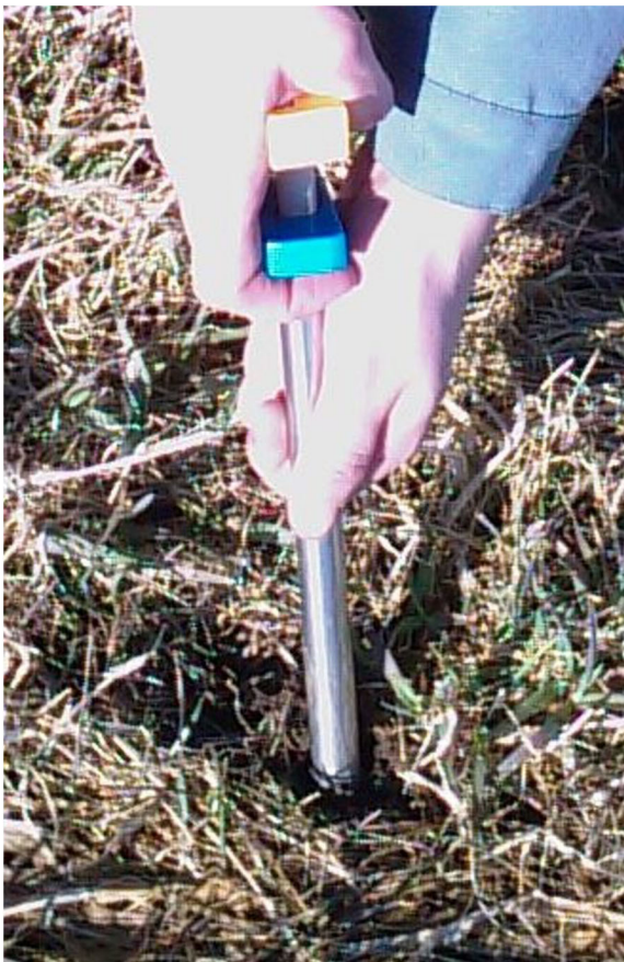
Fig. 1 Pasture soil sampling was performed with a cylindrical metal instrument, inserted in the ground to a depth of 3–4 cm.

The soil sampling was done every 5–10 steps while walking along a W-shaped route, and soil samples were collected by taking an equal sample from the upper ground layer (diameter ~ 2 cm) at a depth of ~ 3–4 cm using an instrument (Fig. 1). Fresh dung was avoided and the sample collection was subsequently repeated in an opposite W-shape, whereby the samplings were randomly distributed over the whole area. For each W-shape route, approximately 50 subsamples were merged into one pooled sample of 400–700 g.