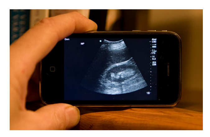
Fig. 2 An example of an image (right upper quadrant Morrison's Pouch) transmitted to an iPhone

The IP interpreted, in real-time, each of the eight video clips. Figure 2 shows a photo with a representative image