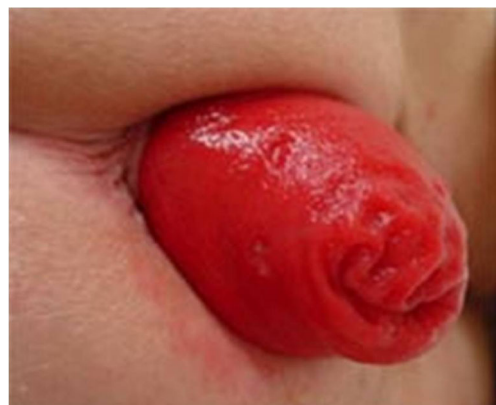
Fig. 2 Photograph showing rectal prolapse

Surgical options include abdominal operations in which the rectum is mobilized down to the pelvic floor with or without dividing the lateral ligaments, and the rectum is then fixed to the sacral promontory with the help of sutures or some form of mesh. The abdominal operations can either be done as open surgery, laparoscopically, or robotically. The other option is perineal surgery, which is traditionally reserved for patients who are deemed unsuitable for abdominal operations, such as the frail and elderly and those who are relatively unfit medically. The procedures normally consist of either a Delorme's operation or a perineal proctosigmoidectomy. In some patients who are unfit, an anal encircling procedure to