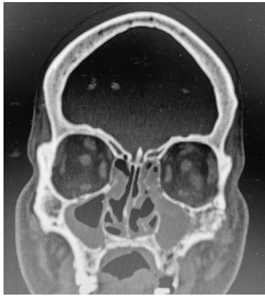
Fig. 2 Coronal section of CT2 of P12 showing the maxillary sinus thickening indicating the presence of disease