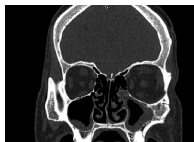
Fig. 1 Coronal section of CT1 of P12 (Patient code) showing paranasal sinus obliteration

For open surgical procedure, intraoral maxillary crevicular incision or Weber Fergusson incision was used. Debridement, sequestrectomy, partial or complete maxillectomy, turbinectomy, and complete removal of the sinus lining through the bony window were performed depending on the level of MSDO. Figure 1 is the CT1 coronal section showing obliteration of the right sphenoid, ethmoid and maxillary sinuses. Figure 2 is the CT2 coronal section of the same case showing the mucosal thickening in the right maxillary sinus and osteolytic changes in the right maxilla. The patient underwent right maxillectomy, turbinectomy, and open maxillary sinus debridement. Figure 3 (CT3 coronal section) shows the fifteen days post-operative coronal section showing loss of right maxilla and disease-free right maxillary sinus (P 12 case). The medicinal therapy in a hospital set-up included dual antifungal drug therapy Inj Amphotericin B (IV, 0.3–0.7 mg/kg/day) and oral Posaconazole (300 mg) and all patients were evaluated fifteen days after the open surgery clinically and with CT scan (CT3). They were closely observed for recovery from infection. We propose a CT-based evaluation scale to