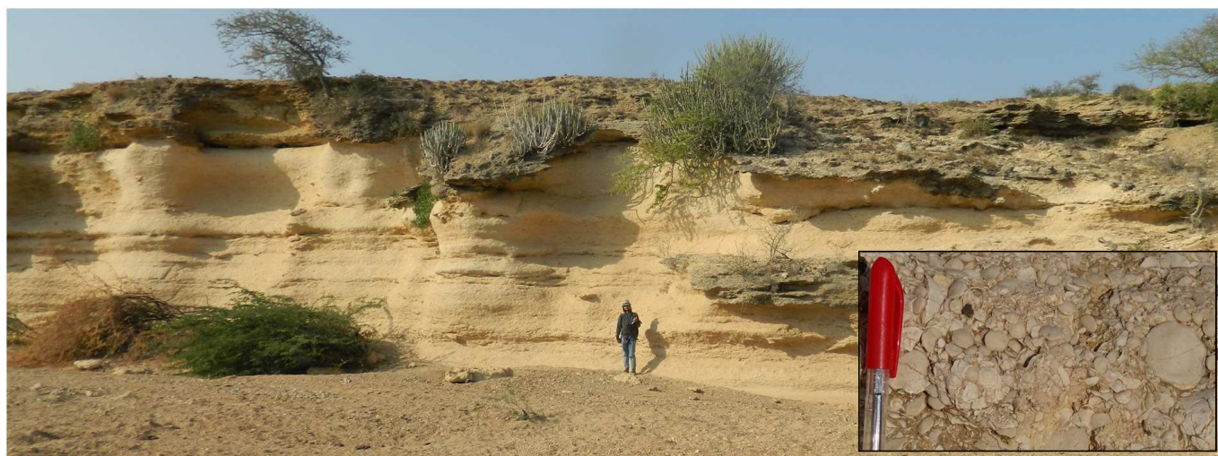
Fig. 1. Favorable warm climate of the Eocene promoted the growth of heavily calcified larger foraminifera along the Tethys. The photograph shows an extensive development of carbonate rocks formed by these foraminifera in Kutch. In the inset is close-up view of the same showing foraminifera as the main constituent.

The evolution and diversification of siliceous and calcareous microbes also impacted sediment distribution. Was it due to the