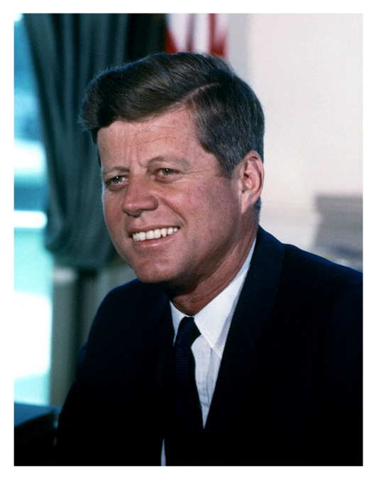
Fig. 5 John F. Kennedy, the 35th president of the US and descendent of immigrants escaping the potato late blight famine in Ireland

potato) was caused by a malfunction in the physiology of the plant. Repeated vegetative reproduction of the potato plant would also lead to some sort of physiological malfunctioning. While sporulation could be seen on these diseased potato plants, it was assumed that this was only a natural course of nature, since dead and decaying matter often had moulds that assisted in their decomposition.