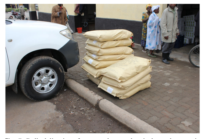
Fig. 7 Bulk deliveries of mancozeb at a chemical supply store in Musanze, Rwanda

Other developments in predictive systems have spurned prediction at a larger scale (Yuen and Mila 2015). Despite these improvements, the adoption of such predictive systems remains modest. One aspect is that the costs of the two types of errors that could be made with a system are unbalanced (Yuen and Hughes 2002). A false-positive (an un-needed fungicide application) has a relatively modest cost, compared to that of a false negative (missing a necessary spray could translate into the loss of an entire crop). Understanding how growers and decision-makers weigh the costs and risks of predictive systems could lead to better implementations of these systems.