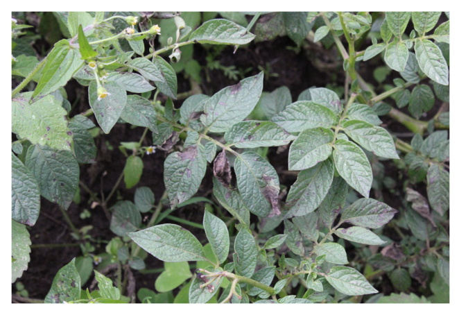
Fig. 1 Foliar symptoms of potato late blight, caused by Phytophthora infestans

my private garden plot, where we had planted potatoes, where I first met the pathogen on a personal basis. I can still remember the combination of the fascination that almost all plant pathologists have when they encounter a disease in real life, as well as the horror that struck me, since I knew that these potatoes were destined for a very untimely ending. The water-soaked lesions on the leaves were quite evident, and I could see the white spore masses that I knew would soon spread to the uninfected parts of the plants. My professional encounters with P. infestans had not yet started, but it was impossible not to be aware of the current research on the pathogen (much of it taking place at Cornell at that time) as well as the historical role it had played with regard to plant pathology and food security.