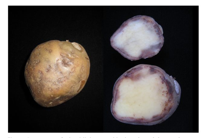
Fig. 3 Symptoms of tuber blight caused by by Phytophthora infestans

using epidemics of late blight in tomato plantings, which often needed assistance through overhead irrigation, as well as borders to prevent spores from moving between the different tomato cultivars. It was in Taiwan that I also realized the importance of proper diagnosis of a disease, after encountering recommendations to use fungicides specific for oomycetes like Phytophthora infestans , against what was clearly powdery mildew (which is caused instead by Leveillula taurica ) on the tomato plants.