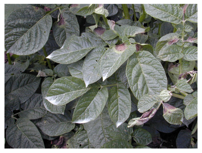
Fig. 6 Residues of mancozeb on infected leaves of potato

Some of the earliest systems for predicting the need of fungicide applications for control of plant diseases were for potato late blight (Beaumont 1947). While the early ones were simple rules using information on duration of certain temperature limits, and a similar measure for some sort of measure of humidity or leaf wetness, these systems have increased in complexity in order to reduce errors that might come about in making predictions for a single field (Bruhn and Fry 1981).