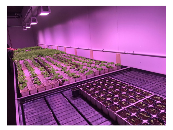
Fig. 1 Photograph of the indoor farm in Högdalen, with lettuce in different stages of development

tables", where water mixed with conventional fertilisers was let on and absorbed into the pots. The leftover water was run back to the water tank. The LED lamps were lit 16 h a day and during this time no additional heating was needed in the cultivation chamber. During the dark hours, small heaters were used to keep the temperature at a good level for the plants. Superfluous heat was let out via the ventilation system. After four to five weeks, the lettuce was ready to be harvested. Only the leaves were harvested - the pots were cleaned and reused for the next batch of produce. In total, six ebb and flow tables occupied the cultivation chamber and approximately 1000 pots had space to grow at the same time. For the sake of research, only lettuce was produced during the first months of running the indoor farm. However, other types of herbs and leaves could be grown in the same room. There was no use of pesticides in the cultivation.