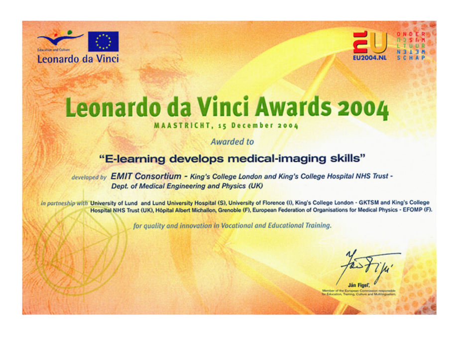
Fig. 2 The Leonardo da Vinci Award for the EMIT Consortium

While most of the above would be mitigated by the commitment and high motivation of students in higher education and the careful choice of e-Learning providers, there are two factors that cannot and should not be ignored. These in our opinion are some of the most important prerequisites for the introduction of e-Learning.