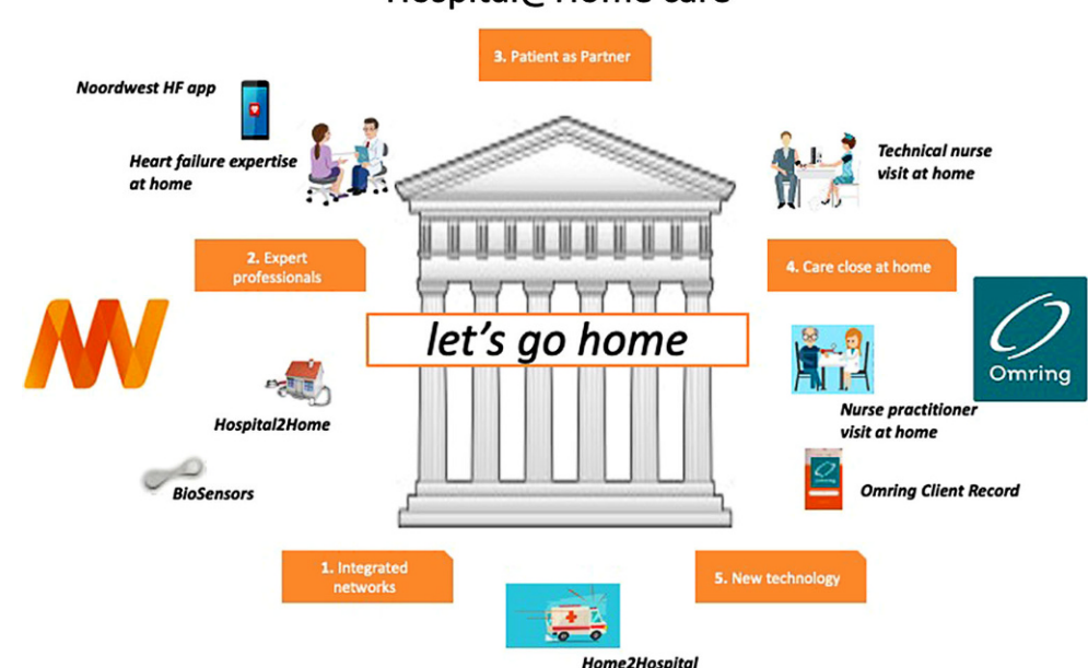
Fig. 1 Organisational hospital-at-home model of the Noordwest Ziekenhuisgroep and Omring. On the left, the Noordwest activities and devices are depicted; on the right are those of Omring. Noordwest develops home-tohospital protocols with mobile laboratory services and hospital-to-home protocols with Omring. Omring provides care at home with technical care nurses and nurse practitioners

The nursing staff may be considered the core developers. They are seven hospital-based nurse practitioners and 12 Omring technical care nurses. During several seminars, the implementation of a hospital at home was devised and logistic, medical and technical issues were addressed in working proto-