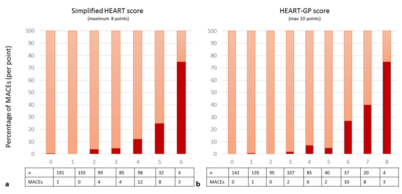
Fig. 2 Percentage of major adverse cardiac events (MACEs) per point of a simplified HEART (a) and HEART-GP (b) score