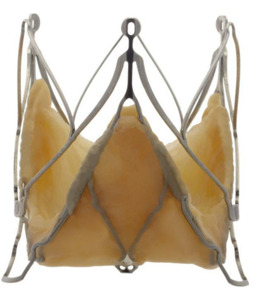
Fig. 1 JenaValveTM prosthesis.

All procedures were performed under general anaesthesia in a specialised fully equipped hybrid catheterisation laboratory. Prophylactic antibiotics were given prior to the procedure. A temporary pacemaker lead was positioned transjugular in the right ventricle and tested at 180 bpm.