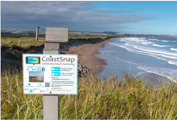
Fig. 2 CoastSnap beach monitoring, Montrose, Scotland. Members of the public are invited to monitor coastal erosion which is resulting in the retreat of the sand dune cordon, a natural form of coast protection, impinging on the adjacent golf course and increasing the risk of coastal flooding inland through several low-level corridors through the dunes. Strategic planning requires a shift from short-term engineering solutions at the coastal edge to dynamic, adaptational land management inland to provide space for relocation of assets to risk-free sites and to accommodate migration of the beach and dunes landward of their present position. This will require partnership and co-operative effort between all agencies, infrastructure providers, non-governmental organisations and businesses with a coastal remit or interest and supported by a funding stream (Rennie et al. 2021a, b)

Throughout the adaptation process cycle, liaison will be essential with the academic community, geological surveys, museums and the voluntary sector to undertake or assist with inventory, risk assessment, scenario modelling, monitoring, research, rescue or posterity recording where appropriate.