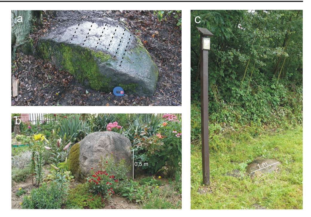
Fig. 3 a Siljan granite and monument of inanimate nature in situ in Lipnik with glacial striae; b boulder in Krepa with aesthetic value; c erratic boulder and monument of inanimate nature in Chinków.