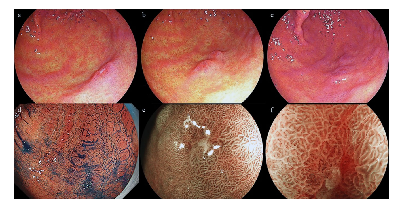
Fig. 1 a An 8 mm poorly demarcated reddish elevated vertucous gastritis-like lesion under linked color imaging (LCI) located at the greater curvature of the gastric antrum. b This lesion changed to a two-hump shape after 1 year. c Although this lesion was slightly lower in height than what was observed in the previous EGD, the findings were similar. d After the indigo carmine dye spraying was

The resected specimen measured 35 \times 30 mm, and the lesion measured 18 \times 16 mm. Figure 2a shows the histopathological mapping of the resected specimen, wherein the