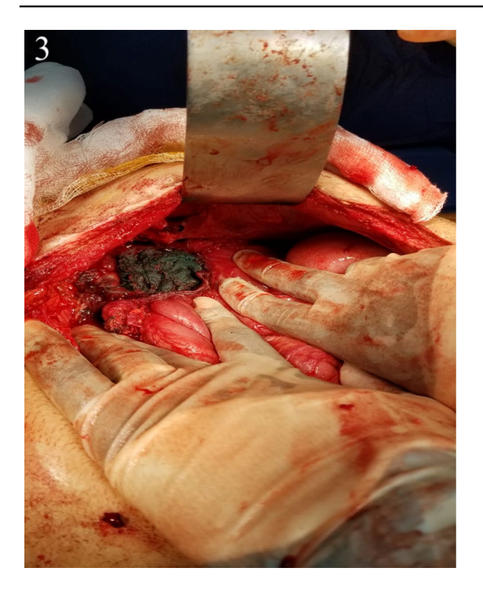
Fig. 3 Intra-operative photograph showing gossypiboma in situ and perforation through the jejunum