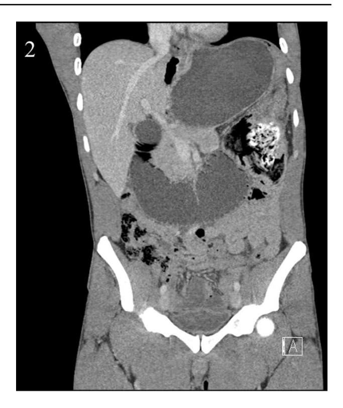
Fig. 2 Coronal CT image showing proximal duodenal and gastric distension secondary to heterogenous intraluminal mass at the duodenal jejunal flexure/proximal jejunum which is suspicious for gossypiboma

further concerns were identified, and the patient was discharged from follow-up care.