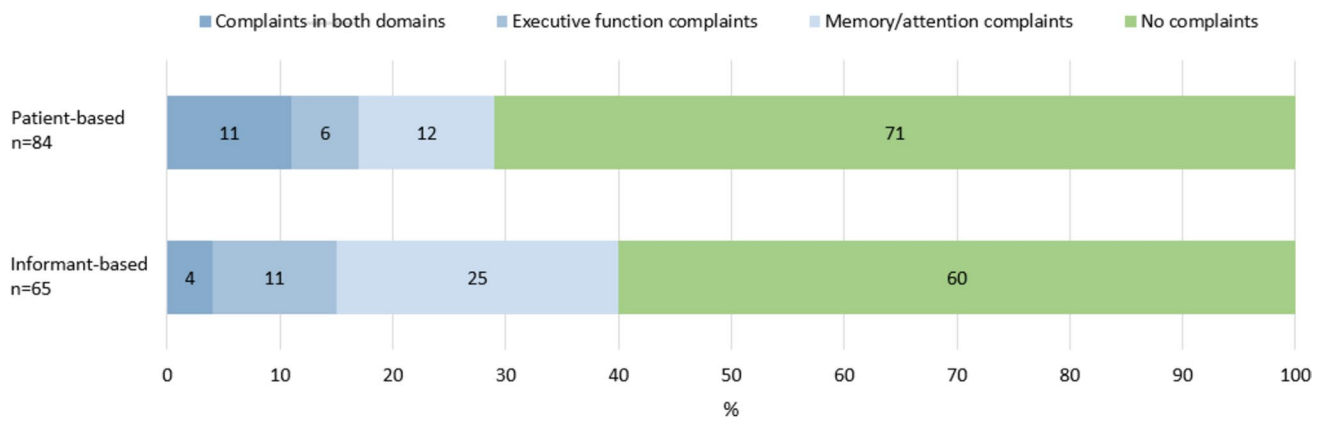
Fig. 1 Relative distribution of participants based on patients' (upper bar) or informants' (lower bar) scores on the Dysexecutive questionnaire. Percentages of patients with (1) complaints in both domains, (2) only executive function complaints, (3) only memory/attention complaints, and (4) no complaints are depicted