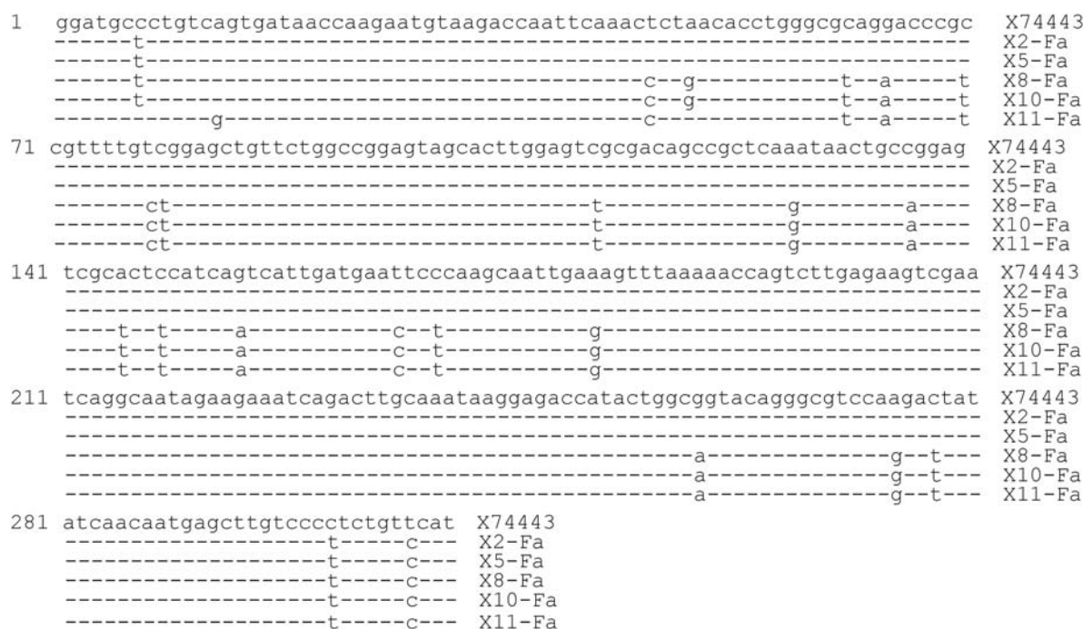
Fig.2. Sequence comparison with reference strain X74443 (GenBank no: GQ184302-06)

ruminants, but there is no access for Tibetan antelope and yak to the endemic area throughout the history of PPR (3). Much effort has been directed towards investigating the possible source and route of transmission through field investigation. Some evidences implies that movement of domestic livestock may play an important role in transmission of PPR, such as sharing pasture and water source between countries, fosterage among relatives, and the tradition of giving livestock as dowry. However, the exact role of wild ruminants such as Tibetan antelope and yellow goat through its movement or seasonal migration for transmission of PPR still remains unknown. Such study is very difficult, if not impossible, since sample from wild animal is not available due to strict regulation of wild animal protection. However, it is clear that there was no visible clinical sign among wild ruminants during the disease outbreak in Tibet in the regions heavily populated with wild ruminants, especially Tibetan antelope. In our related study, it was