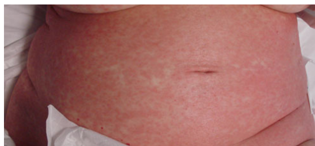
Fig. 1 Maculopapular rash on the trunk

One in 260 patients treated with allopurinol develops DRESS [1]. Renal failure is common, and maculopapular exanthema is the most frequent skin manifestation [2]. The mortality rate is higher in comparison to hypersensitivity