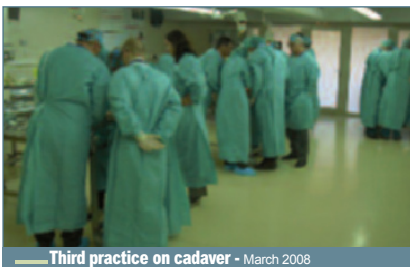
— Third practice on cadaver - March 2008