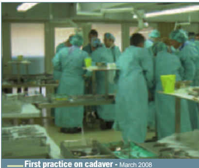
— First practice on cadaver - March 2008

Day two of the course focussed on Anterior Approaches to the Cervical Spine. Following a similar format of the first Posterior Cervical day, lectures included Trans Oral Approach by Claes Olerud, Anterior Approach Sub-axial Spine – Fusion or Disc Replacement? – by Jan Goffin, Intersomatic Devices & Multi-level Corpectomy – Bengt Lind and finally