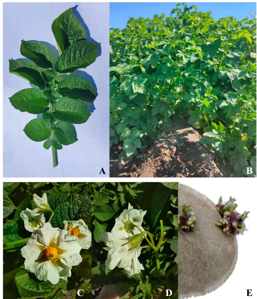
Fig. 2 Plant (A), leaf (B), flower (C–D) and sprout (E) characteristics of Svalöf

z Nonreplicated trial using 10-plant plot for Svalöf and 2 rows of 20 plants per plot for check cultivars