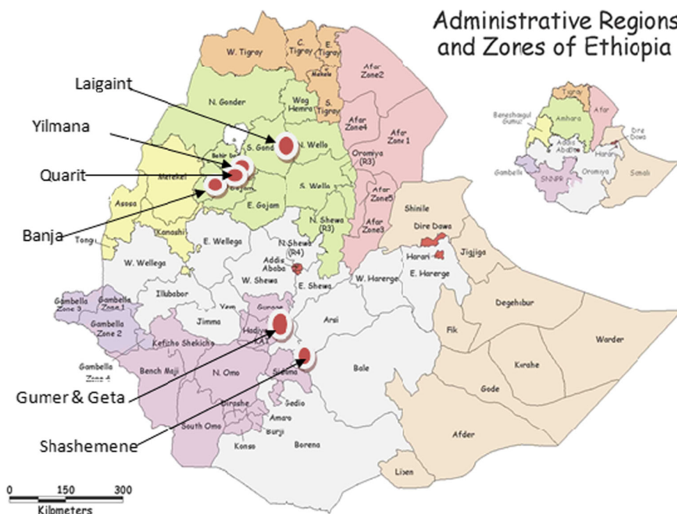
Fig. 1 Survey sites across major potato growing districts during 2012 and 2014

The Map Created by: Disaster Prevention and Preparedness Commission (DPPC) Information Centre UN OCHA-Ethiopia