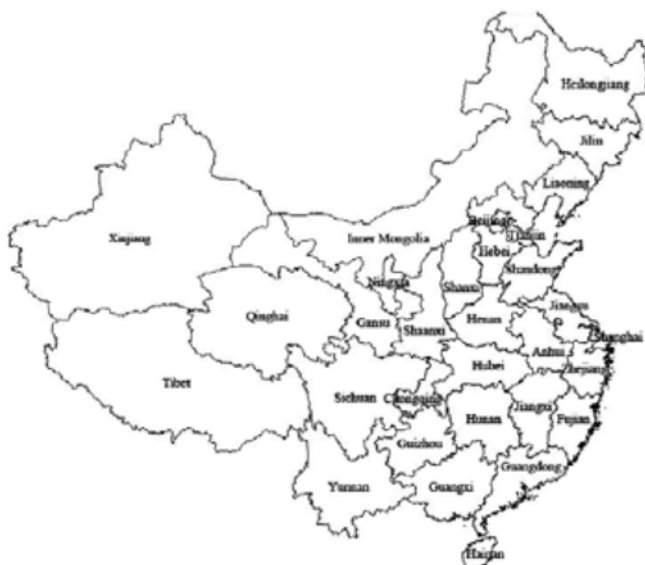
Fig. 2. Map of Chinese Provinces