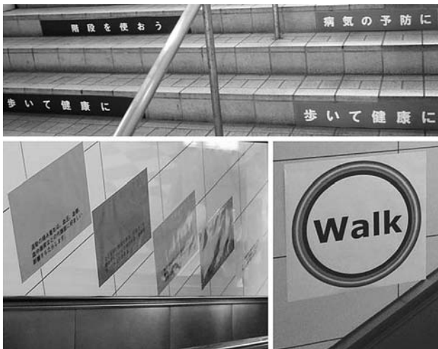
Fig. 2 An illustration of the signs: top photo stair-riser banners 1 and 2, bottom-left photo poster 1, bottom-right photo poster 2