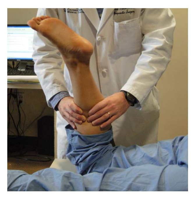
Fig. 2 Normal Thompson's test. Note plantar flexion of foot with squeezing of the calf. Indicative of intact Achilles tendon

Diagnosis of an acute Achilles tendon rupture can usually be made by history and physical examination alone. MRI or ultrasound can be helpful in cases of suspected rupture for pre-operative planning, but is usually unnecessary. The patient will often describe abrupt severe pain over the tendon with an activity requiring forceful plantar flexion such as while playing tennis. Often the patient will feel a "pop" or have the sensation of being hit in the back of the heel. Physical examination signs that suggest Achilles tendon rupture include weakness of plantar flexion and a palpable defect over the posterior calf. A Thompson test is performed by squeezing the calf and observing motion at