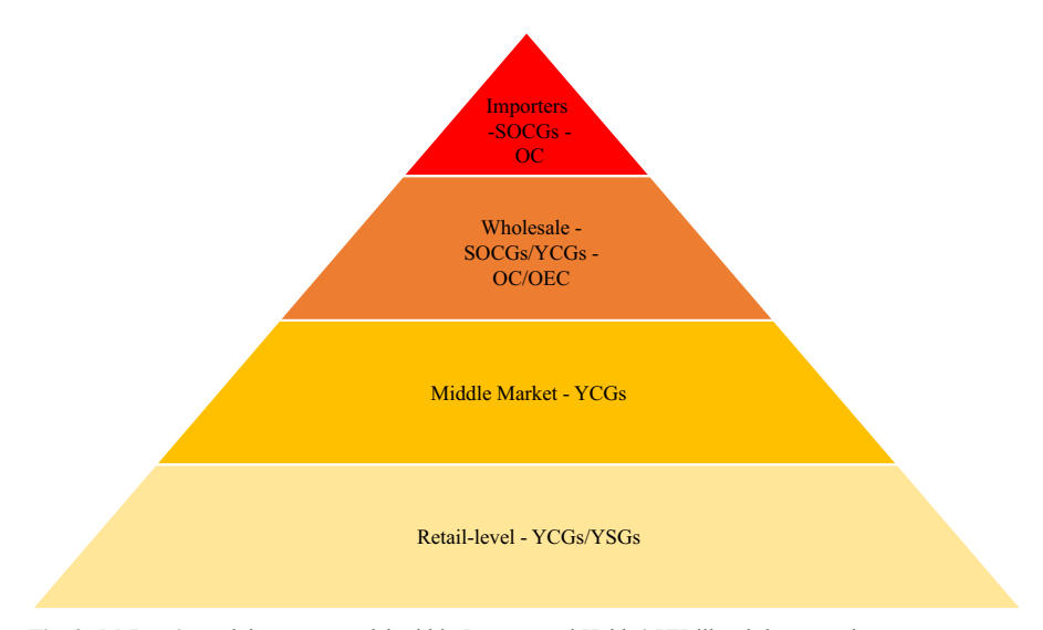
Fig. 2 McLean's evolving gang model within Pearson and Hobbs' UK illegal drugs market

To help place these findings into context for easy interpretation by practitioners and law enforcement, the findings are now placed within Pearson and Hobbs' (2001) model of the UK's illegal drugs market. Pearson and Hobbs' model is uniquely applied here to the Scottish context. As Aldridge (2011) notes, regional differences within the UK may not only see gang types differ but also activities they are involved in. Likewise, note that market level is defined in terms of how gangs purchase, store and supply drugs, as opposed to making reference to a specific drug type. Figure 2 (below) illustrates the position of the illegal drugs market that Scottish gangs are likely to operate within and likewise makes reference to whether or not such activities can truly be considered OC. Where activities cannot be considered OC (due to the lack of efforts to actually control the