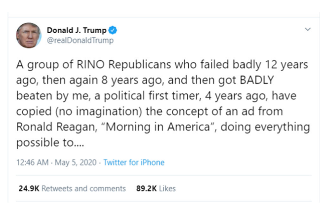
Fig. 1 Trump response to "Mourning in America"

Creating emotionally evocative political ads and grabbing the press's attention are not new endeavors for members of the LP team. The members' campaign and attack ad experience dates back decades. John Weaver worked on Senator John McCain's 2000 primary campaign, helping to cultivate his "maverick" image and devising McCain's famous bus tour, dubbed the