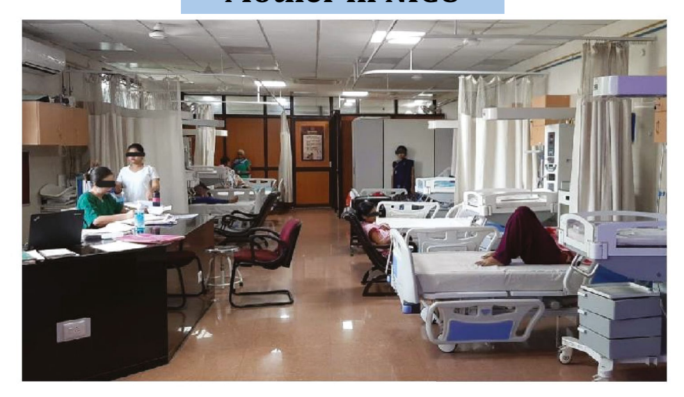
Level II NICU - Mother and baby cared together 24*7