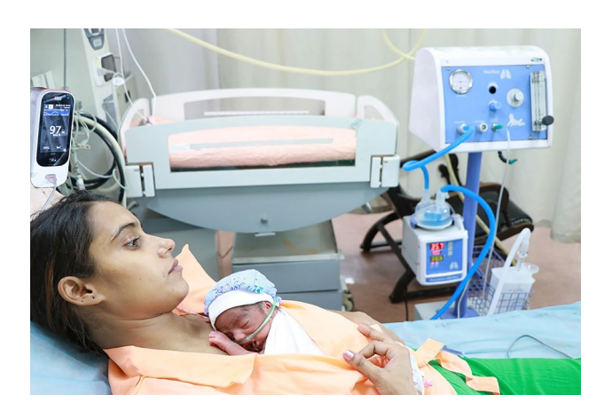
Fig. 3 Providing continuous positive airway pressure (CPAP) in KMC position

Majority of babies < 1.8 kg are preterm and many of them develop early respiratory distress requiring respiratory support in the form of CPAP. Learning to provide CPAP in KMC position was an important challenge [16]. Nasal Interface for CPAP was optimized, and standard operating