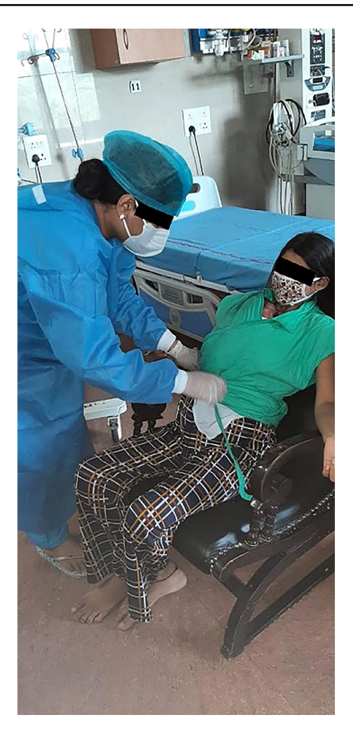
Fig. 4 Mother-newborn care unit (MNCU) during the COVID pandemic

This will need infrastructure changes. The main issue in most of the hospitals is nonavailability of adequate space.