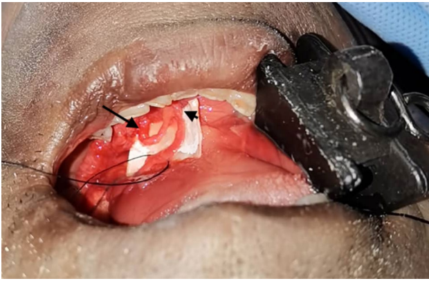
Fig. 1 Image showed left SLG has a major duct (black arrow) that joins the SMG duct (black arrowhead) prior opening at the papilla