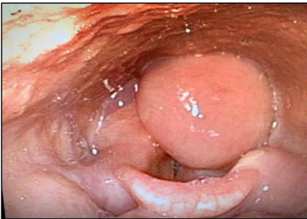
Fig. 1 Microlaryngoscopic examination. Direct laryngoscopy showed a supracordal reddish nodular mass with no ulceration of the overlying mucosa