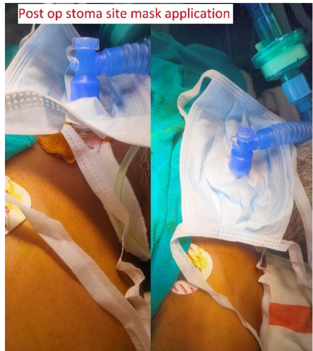
Fig. 2 A surgical mask is applied in between tracheostomy tube and ventilator circuit there by containing droplet contamination

The MERS pandemic provided the first clues and directions to deal with the current one. Those previous guidelines formed the basis of performing high AGPs during the COVID 19 pandemic. With time and