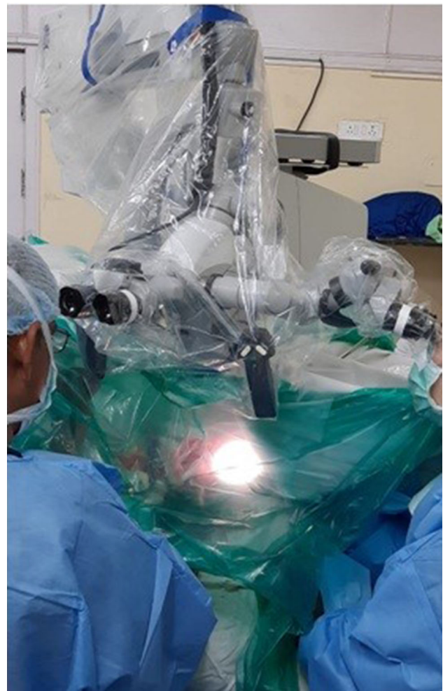
Fig. 2 Showing the Surgeon operating by insinuating his hands below the surgical drape

This innovative idea to mitigate aerosolisation of the operative field prevents exposure to the health personnel. This assembly of draping allowed adequate visualisation and surgeon manipulation as transparent drapes were utilised. No loosening of the drapes were observed and owing to the secure configuration provided by the steri-drape and the sterile adhesive stickers. The steri-drape was stretchable to a certain degree which allowed minor adjustments of the microscope throughout the surgery. This technique of draping is highly economical and well suited for the