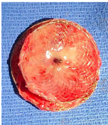
Fig. 1 Right atrial surface of the explanted 27-mm Figulla® Flex 2 Occlutech ASD occluder