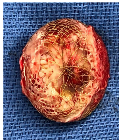
Fig. 2 Left atrial surface of the explanted ASD device

wound and subsequent deconditioning. Her pain was controlled with assistance from hospital acute pain services and she was discharged to inpatient rehabilitation 10 days postoperatively. She was discharged home after a brief period of rehabilitation.