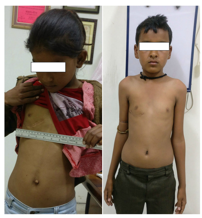
Fig. 2 Postoperative surgical scar

The most important part of this procedure was good surgical exposure. All the operations were performed with the standard cardiopulmonary bypass through central cannulation with moderate hypothermia. Aortic and venous cannulation was same as in standard sternotomy. We used long snares