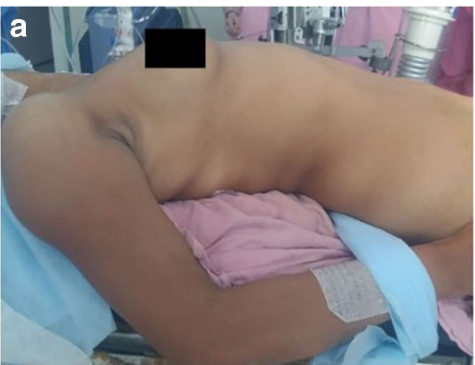
Fig. 1 a Thoracotomy position. b Operative exposure