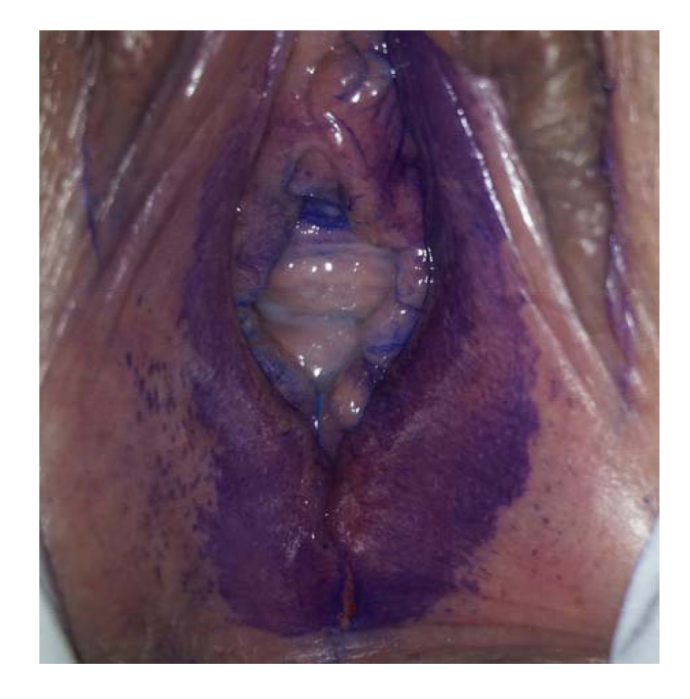
Fig. 2 U-shaped staining of the introitus after toluidine blue dye

<sup>b</sup>Fisher's exact Test if not differnetly indicated <sup>c</sup>Wilcoxon Two-Sample Test