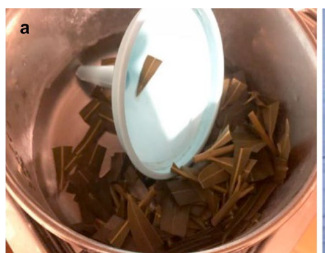
Fig. 1 Items found at the death scene: (a) the steel pan containing 256.8 g of dark green leaves, small pieces of stem, and a plastic funnel; (b) the second smaller steel pan containing 400 mL of yellow fluid infusion

The intake of oleander leaves, or the infusions obtained from various parts of this plant is uncommon for suicidal purposes and only a few cases are reported in the literature [13, 15, 16]. Different analytical methods for the identification and quantification of oleandrin are available. These include techniques from the rapid digoxin and digitoxin immunoassay for clinical purposes [17], to liquid chromatography-electrospray tandem mass spectrometry (LC–MS/MS), which is the best analytical approach to oleander poisonings of forensic interest [1, 2, 18]. Although in fatal cases