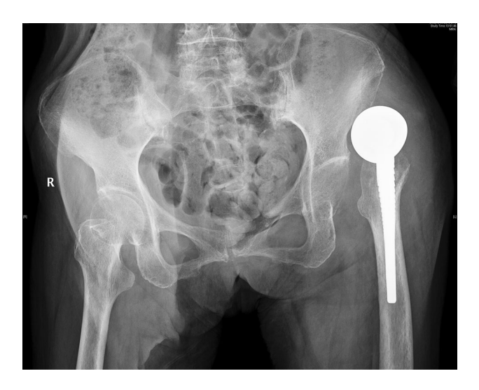
Fig. 2 The radiograph shows a bipolar hemiarthroplasty dislocation in a female patient.

Univariate analyses were performed (Appendix 1. Supplemental material is available with the online version of CORR<sup>®</sup>.). After controlling for relevant confounding