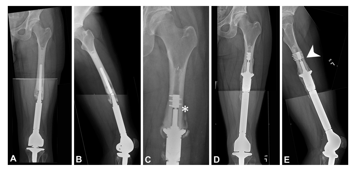
Fig. 1A–E Preoperative ( A ) AP and ( B ) lateral radiographs of a 22year-old man show a fractured cemented femoral stem 4 years after resection of a distal femoral osteogenic sarcoma. ( C ) An AP radiograph reveals mechanical failure, defined as a loss of compression between the anchor plug and spindle (asterisk), 5 months after

compression distance of the traction bar between the anchor plug and spindle (Fig. 1) and by evidence of bone hypertrophy proximal to the spindle.