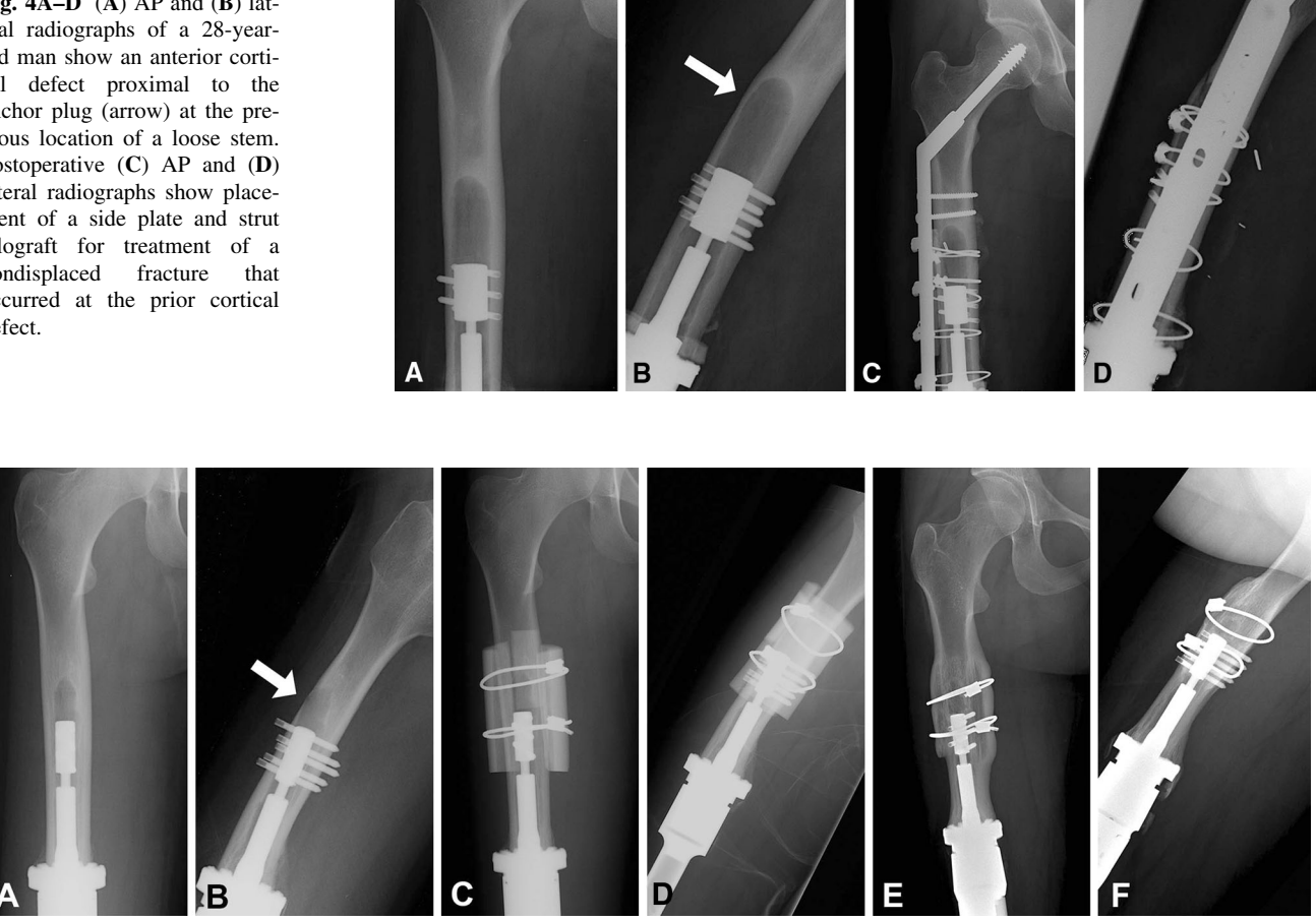
Fig. 5A-F (A) AP and (B) lateral radiographs of a 15-year-old girl show an anterior cortical defect (arrow) proximal to the anchor plug at the previous location of a loose stem. Postoperative (C) AP and (D)

Fig. 4A-D (A) AP and (B) lateral radiographs of a 28-yearold man show an anterior cortical defect proximal to the anchor plug (arrow) at the previous location of a loose stem. Postoperative (C) AP and (D) lateral radiographs show placement of a side plate and strut allograft for treatment of a nondisplaced fracture that occurred at the prior cortical defect.