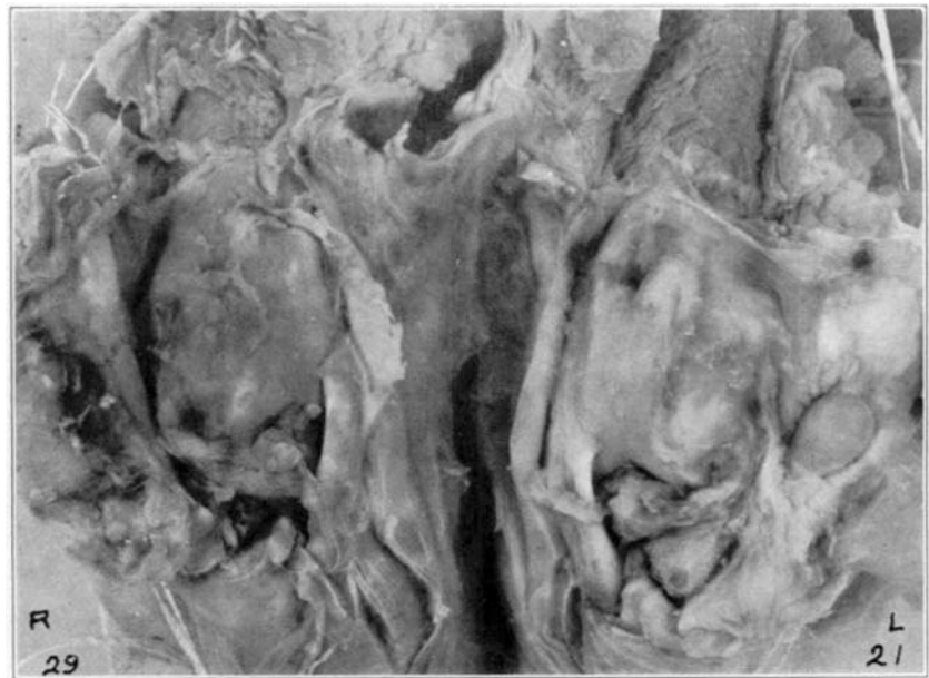
Fig. 1 Rabbit No. L. Knee Joint No. 21 treated with Pregl's solution shows much less hypertrophy of the synovia and pannus than the untreated Knee Joint No. 29. There was considerable erosion of the cartilage in Knee Joint No. 29, whereas cartilage of No. 21 was smooth.