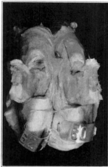
Fig. 4 Rabbit No. K. Knee Joint No. 60, after treatment with Pregl's solution appeared practically normal, while Knee Joint No. 62, which was untreated, showed considerable loss of cartilage and synovial thickening.

both joints were extremely swollen and fluctuating. Effort was made to remove the effusion by needle, but the material could not be withdrawn. Exploratory arthrotomy was performed in this instance and the thick seropurulent fluid withdrawn. Knee joint of No. 42 was treated with Pregl's solution every three to five days, while the knee joint of No. 48 was untreated. Thereafter the rabbit developed a generalized infection, and died three weeks after treatment was started. Although the cartilage of the femoral articulation of both joints was largely destroyed, there was considerable pannus thickening of the synovia about the margins of the knee joint of No. 48. The synovia of the knee joint of No. 42 was in no wise thickened, although it did give evidence of an extensive diseased process.