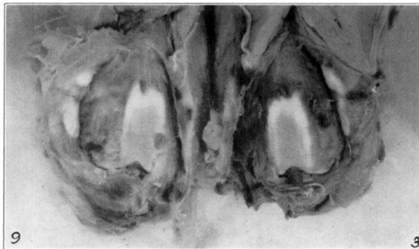
Fig. 2 Rabbit No. N. Note the marked difference in the synovia and cartilage edges between Knee Joint No. 9, which was treated with Pregl's solution, and Knee Joint No. 3, in which no treatment was administered. No. 3 was extremely red, thickened, with extension of

synovia over the femur with adhesions on the inner aspect, frayed margins, and destruction of the cartilage along the edges of the condyle as well as of the patella; while No. 9 had a clean, bright, normal-appearing synovia and the cartilage injury was apparently healing.