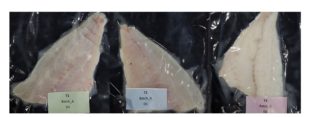
Fig. 2 Pictures of fish fillets. T1, T2, and T3 correspond to the marination control (MC), vacuum impregnation (VIM), and vacuum impregnation followed by the pressurization at 250 MPa for 6 min (VIM + HHP) samples, respectively

throughout the storage period. This finding agrees with other studies that have attributed this whitening effect to protein changes, leading to an increase in light reflection (Giannoglou et al., 2021; Oliveira et al., 2017). However, mackerel pressurized at 150 MPa for 2.5 min or coho salmon pressurized at 200 MPa for 30 s had no effect on lightness after processing (Aubourg et al., 2013a, b). Lightness was unaffected during the storage of non-pressurized samples (MC, VIM), whereas VIM+HHP samples showed a tendency toward darker colors. It is unclear whether this effect was caused by the browning of heme pigments and the progression of lipid oxidation