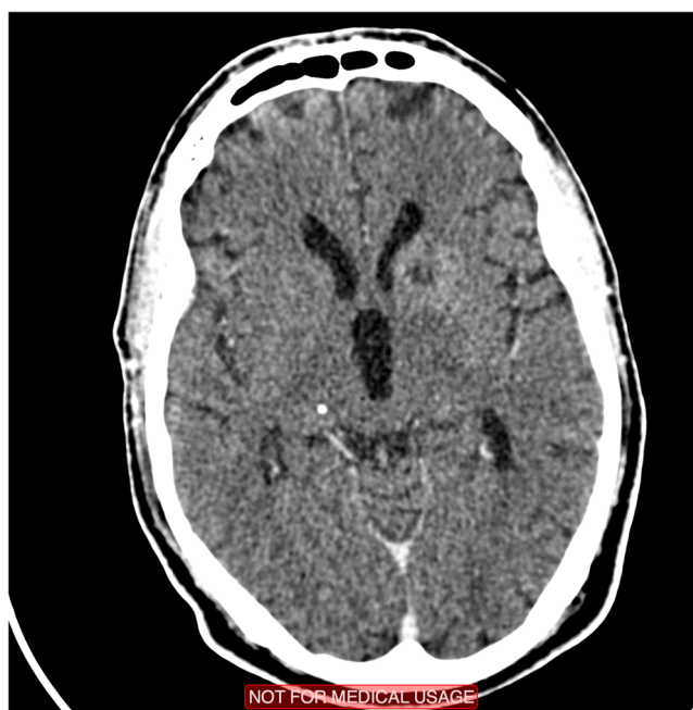
Fig. 1. Computerised tomography (CT) of the head with evidence of probable perforator territory infarction on the left in an HIV-1-infected patient with tuberculous meningitis.

gelatinous fibrocellular leptomeningeal infiltrates initially enveloping the vessels including the carotid arteries, middle cerebral arteries and their branches. Vasculitis within the affected vessels may occur with intimal proliferation. This process with or without superadded thrombosis leads to cerebral infarction [89]. There is no established prevention or treatment for stroke in TBM. Corticosteroids do not prevent stroke [56]. Aspirin has antiplatelet, anti-aggregant, anti-inflammatory and antioxidant properties [94, 95]. In a study of zebrafish, models with the hyperinflammatory LTA4H phenotype treated with aspirin showed reduced expression of pro-inflammatory eicosanoids and TNF alpha with subsequent modulation of inflammatory response [96]. In a placebo-controlled trial of aspirin in 118 adult patients with TBM in India, 150 mg OD aspirin was associated with a significantly lower 3-month mortality and a lower incidence of stroke that was not significant [97]. These findings suggest the effect of aspirin may be as much anti-inflammatory as anti-thrombotic. Following this, a similar study in South Africa randomized 146 children with TBM to receive low-dose (75 mg/24 h) ( n = 47 ) or high-dose (1000 mg/24 h) aspirin. In this trial, there was no significant effect of aspirin on mortality; however,