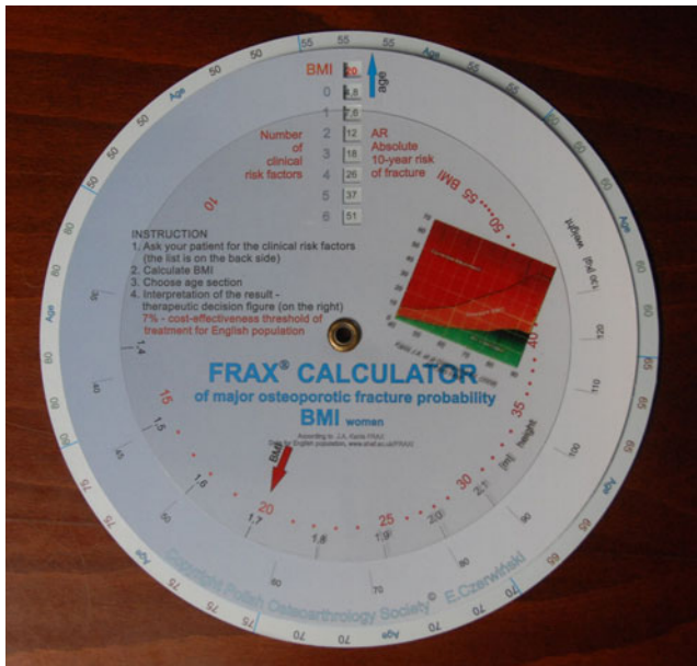
Fig. 1 Hand-held FRAX calculator: general view on the side calculating fracture risk based on BMI

I wish to clarify that in Poland there is no FRAX on CD. Instead, in 2009 we developed a hand-held calculator which enables fracture risk calculation without using a computer. It consists of four independent paper disks with data and a window showing the result of calculations (Fig. 1). On one side BMI is calculated (known body weight and height), then shows 10-year risk of a fracture according to a number of risk factors (Fig. 2). The other side the calculator does the same