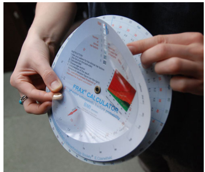
Fig. 2 Hand-held FRAX calculator: the transparent disk with an arrow indicates BMI. This is calculated when weight is matched to height on the next disk

E. Czerwinski (✉) Department of Bone and Joint Diseases, Medical College Jagiellonian University, ul. Kopernika 32, 31-501 Krakow, Poland e-mail: czerwinski@kcm.pl