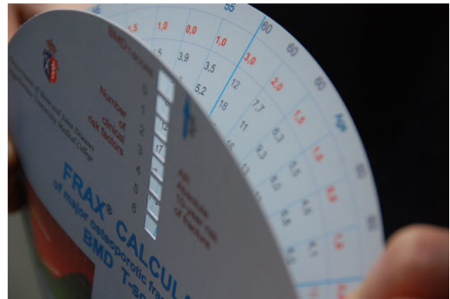
Fig. 4 Hand-held FRAX calculator: On the outer disk there are numbers indicating risk factors. When the T-score appears in the window fracture risk may be read according to the number of risk factors

Below the text I'm enclosing a few photos presenting how it works and I am sending an original to you and the author by mail. This calculator is supposed to be used in the