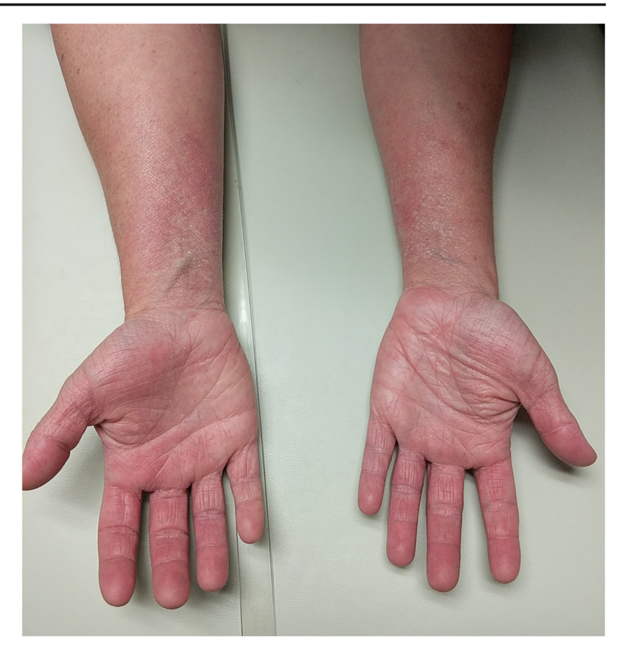
Fig. 1 Clinical image of ACD

features such as Langerhans cell collections in the epidermis, eosinophilic spongiosis, and multinucleate dermal dendritic fibrohistiocytic cells have been associated with allergic CD [7, 8]. Comparatively, ICD may acutely present