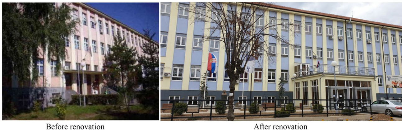
Fig. 1 Studied building before and after renovation

The subject of this research was the basement with ground surface of about 400 m 2 . The scheme of surveyed workrooms is presented in Fig. 2. The north side of studied part of building is under the ground about 1.8 m, while the south side is about 1.3 m under the ground. Energy renovation procedures of building were performed 2 months prior to first survey of radon measurements. The exterior walls of the building have been thermally insulated with Styrofoam, and all the windows have been replaced