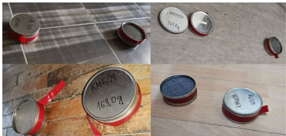
Fig. 3 Charcoal canisters deployed face up/down on different flooring types

The adsorption method proposed by IAEA Technical Report Series no. 474 (IAEA 2013) was used for radon exhalation flux measurements using activated charcoal canisters placed face down to the flooring surface being investigated (Fig. 3). After such exposure, the canisters are again sealed