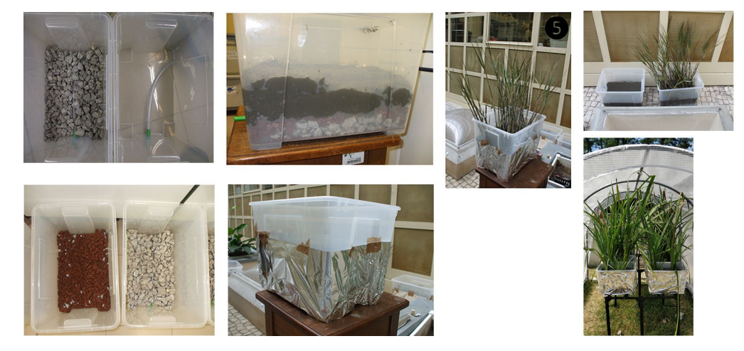
Fig. 1 Assembling a CW lab scale model. Protocol and video in https://ociimarnaescola.ciimar.up.pt/OceanClass.php