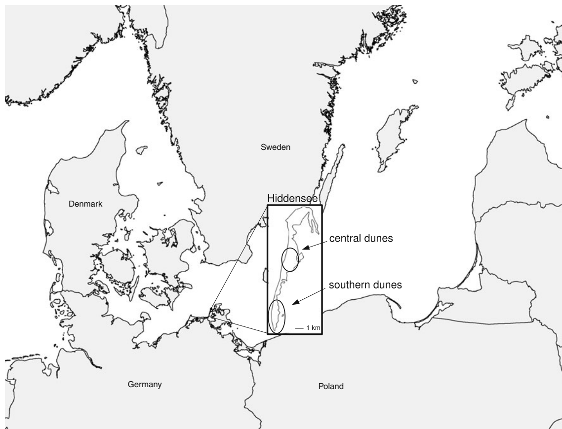
Fig. 1 Map of field sites

dune areas (ca. 4 ha) was compiled by field mapping (transect walks) supported by geo-referenced aerial photographs.