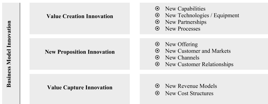
Fig. 1 BMI Categorization (own illustration following Kraus et al. (2022b))

The model delineates three categories of BMI. First, in terms of “value creation innovation” technological advancements play a pivotal role in driving BMI (Clauss 2017). Companies striving to gain a competitive edge must continuously innovate through the adoption of new technologies or processes (Needleman et al. 2021). This necessitates the acquisition of expert knowledge of the new technology and its broader context (Desai et al. 2014). Regarding AI, companies must be adept at integrating technical innovations into an existing landscape. Second, “new proposition innovation” of BMI is driven by the emergence of new markets and sales channels, requiring organizations to adapt their internal and external communication processes (Needleman et al. 2021). The introduction of new products and services through BMI necessitates changes to the existing strategy of a company, which entails modifying both the technical implementations and process structures simultaneously. Last, the expansion of revenues is a significant driver of BMI in “value