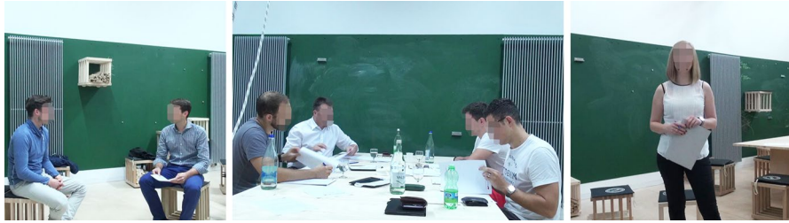
Fig. 2 Assessment-center setup (role play, group discussion, presentation). This figure is not included in the article's Creative Commons licence

achievement; influencing others , which reflects how successfully an individual can steer others either to adopt a certain point of view or to do or not do something; organizing and planning , which reflects individuals' ability to organize their work and resources systematically to accomplish tasks; and problem-solving , which reflects how individuals gather, understand, and analyze information to generate realizable options, ideas, and solutions (Arthur et al. 2003).